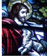
“Let the children come to me”

If that is the most important reason I then ask you, are you holding up your end of the bargain? Are you raising your children in faith? Do you take them to church on Sundays? Are you teaching them of the traditions of your faith? Are you making sure you are also nurturing your faith life? We at Immaculate Conception School have something no public school has. We have the luxury and privilege to share our faith, and to pray at